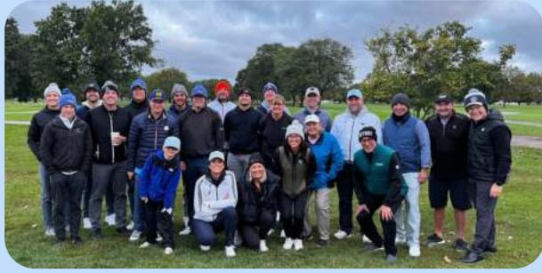
Chandler Park Group

Year three was another success working towards building game changers! 30 golfers, 2,929 holes played, 11.5 hours, $69,688 raised!