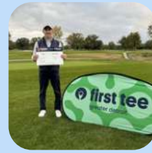
Plum Hollow Group